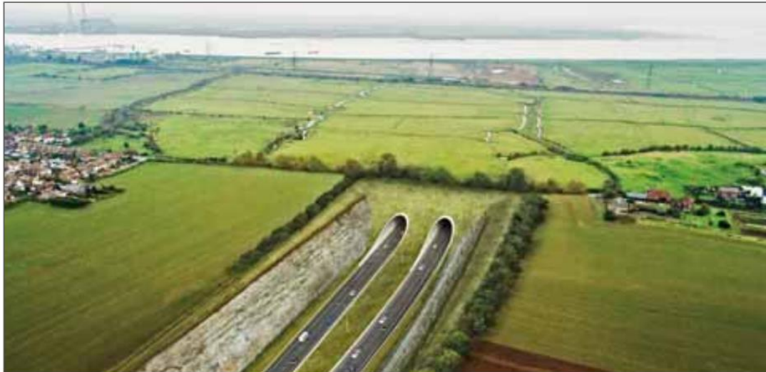
Illustrative image showing potential tunnel approach south of the river

Further public consultation and opportunities to comment on the proposals